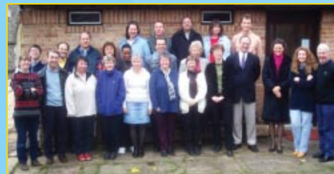
In November our teaching team got together for the first time with representatives from as far apart as Cumbria and Southampton. The team is gearing up to run a host of events this year.