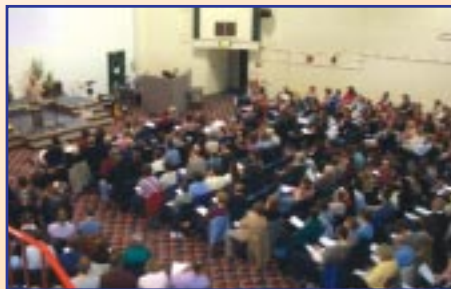
A Recent Event At Winchester Family Church

There are now hundreds of churches in the UK using the Freedom In Christ approach, from the largest to the smallest across all denominations and streams. This is set to increase significantly with the launch of The Freedom In Christ Discipleship Course, a straightforward way of introducing the approach into a church. We are always willing to advise leaders on any aspect of implementing the approach. Our website is a good place to start: there is a comprehensive section for leaders which we continually update with the latest information and hints and tips.