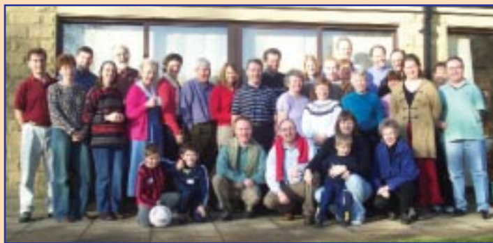
Members Of The Teaching Team And Their Families

Our role is simply to give away the life-changing message of freedom that the Lord has entrusted to us. We hold various events around the country to equip leaders: Church Leaders Briefings introduce the Freedom In Christ approach, usually with leaders on-hand to share their own experiences. Living Free In Christ conferences cover the basic teaching that leaders can take back to their own settings. Helping Others Find Freedom In Christ workshops explain the principles behind the Steps To Freedom In Christ and give practical guidance on getting started in your own setting.