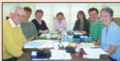
The "Deeply Wounded" Ministry Team

We have discovered that no Christian, no matter how badly "messed up" they seem, is beyond finding real and lasting freedom in Christ. But simply praying for them or with them isn't the whole answer - they need to be taught how to resolve personal and spiritual conflicts and take hold for themselves of what Jesus has done for them. Many leaders have found the advice of our "Deeply Wounded" team invaluable and have been amazed to discover that those whom